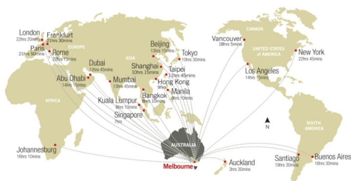
INTERNATIONAL FLYING TIMES

Please refer to the following maps showing international and domestic flying times to Melbourne.