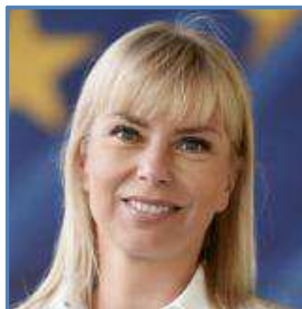
COMMISSIONER Elżbieta Bieńkowska

The letter in question was a complaint on behalf of the Croatian nurses who have completed high school before the references dates mentioned in Annex V of Directive 2005/36/EC. The Commission informs the nurses who have complained that it has decided to open an EU Pilot investigation to enquire with the Croatian authorities about the professional status of general care nurses trained at vocational level to Croatia's accession to the EU.